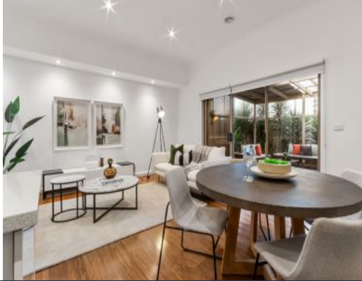
3/81 St Vigeons Road Reservoir, VIC