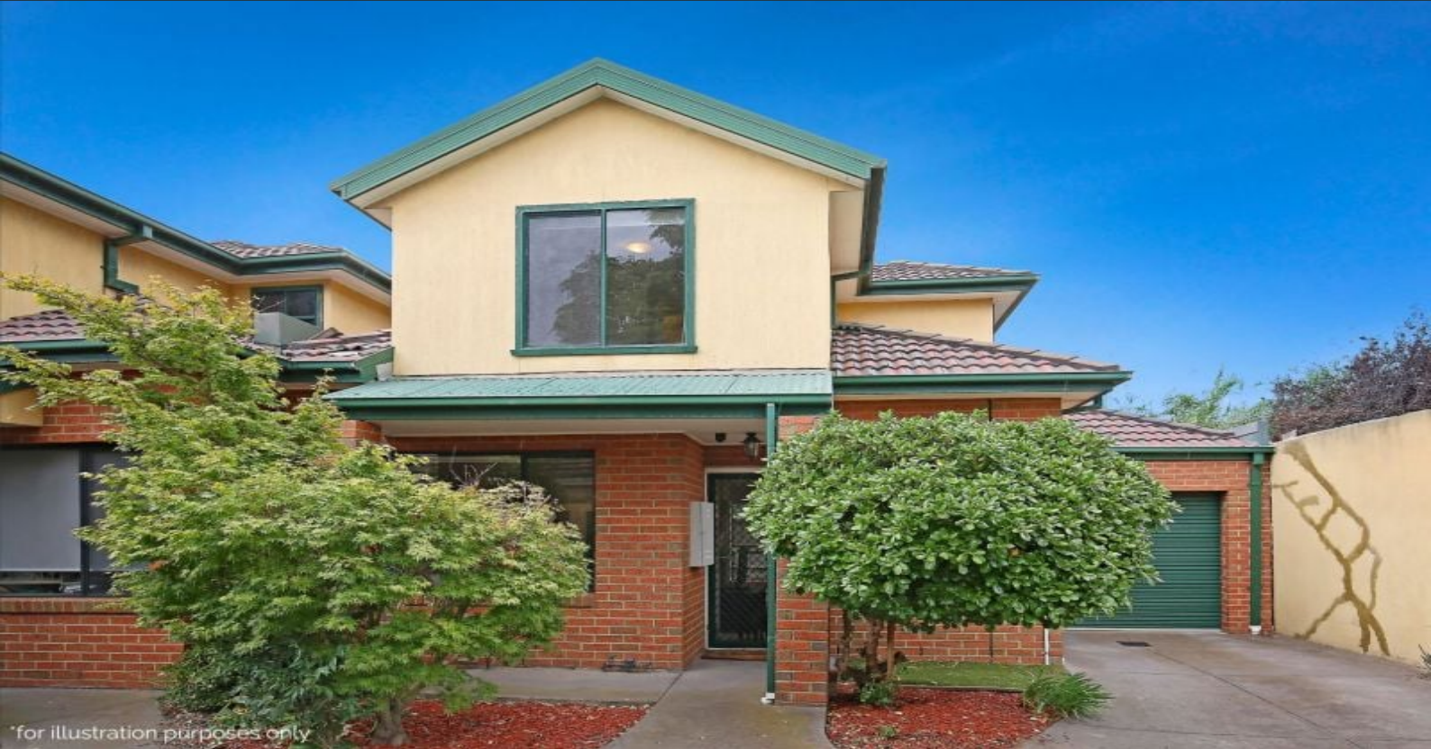
*for illustration purposes only