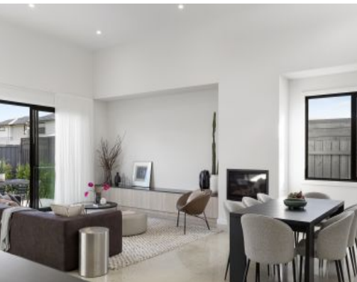
129 Ballantyne Street Thornbury, VIC