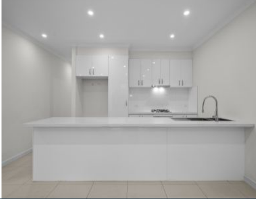
3/15 Linoak Avenue Lalor, VIC