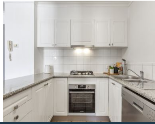
19/38-52 Chapman Street North Melbourne, VIC