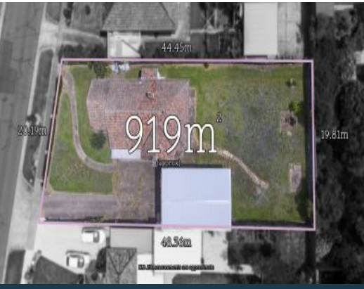
34 Gellibrand Crescent Reservoir, VIC